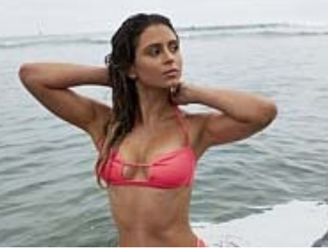
These female athletes are in phenomenal shape and not bashful about showing it off.