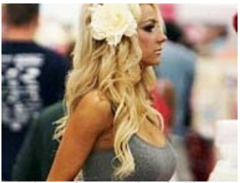
Walmart Cameras Caught These Hilarious Photos