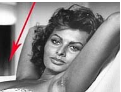
Unnerving Historical Photos That Will Leave You Speechless