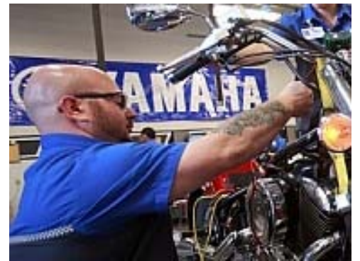
Skilled motorcycle techs are in demand. Get the training you need to succeed at MMI. Click here!