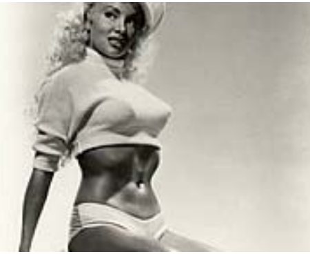
Never Before Seen Photos From The Past