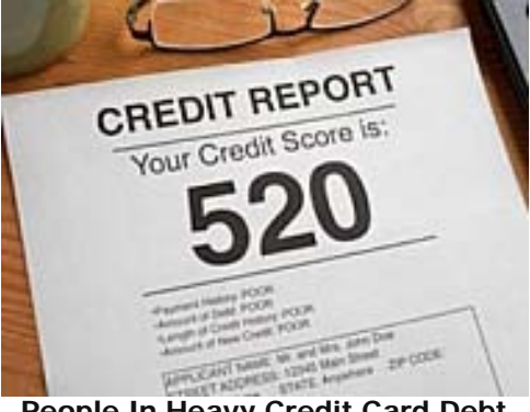
People In Heavy Credit Card Debt Should Know This

This is why you don't mess with the US! Watch What Happens!