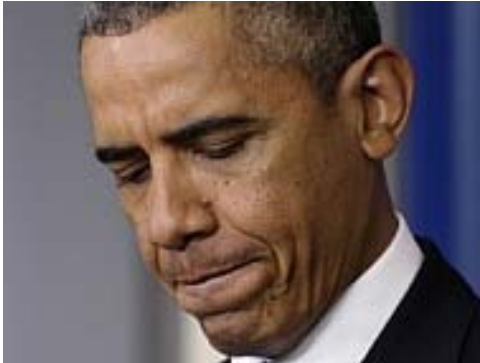
Presidents Ranked from First to Worst