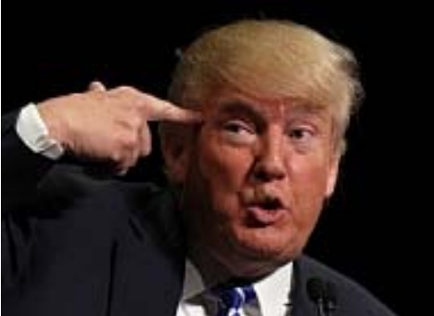
25 Facts About Donald Trump Most People Don't Know