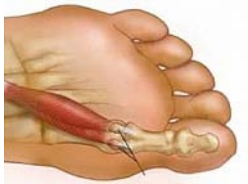
The 4 Stages to a Heart Attack. Find out if you're at risk